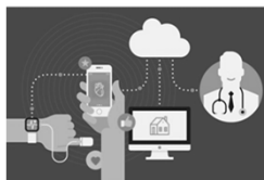
Connected Devices / IoT